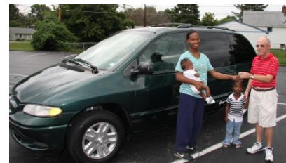
The second car we placed last month was