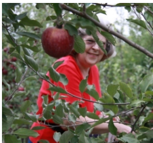
Bonnie will pick you some,