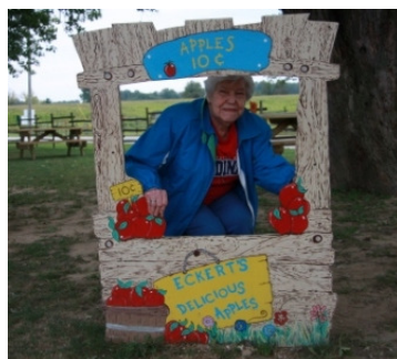
Alberta will sell you some,