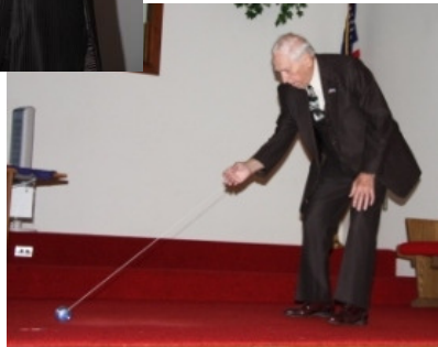
20ft AWANA Banana Split